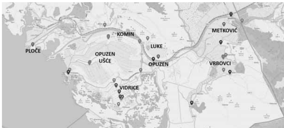
Picture 1. Map of long-term and automatic continuous monitoring locations (meteorological, hydrological and soil and water quality data)