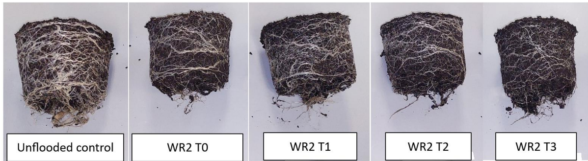
Figure 3. Root systems of Brassica oleracea var. capitata under different treatments: Unflooded control, later flooding control (WR2 T0), later flooding ExelGrow® treatment (WR2 T1), later flooding Organico treatment (WR2 T2), and later flooding Eco Green treatment (WR2 T3).