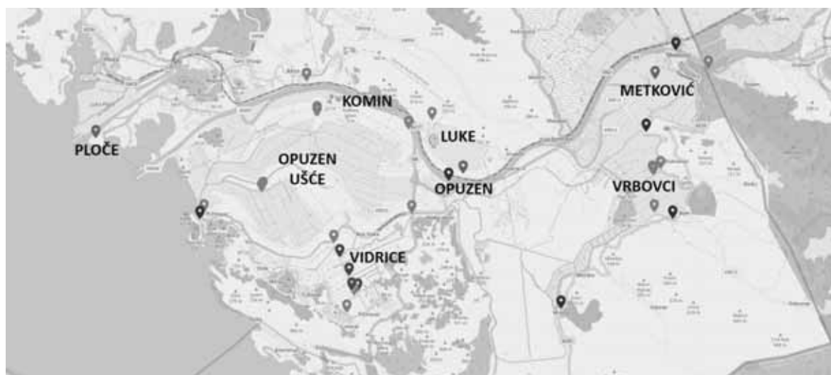
Picture 1. Map of long-term and automatic continuous monitoring locations (meteorological, hydrological and soil and water quality data)